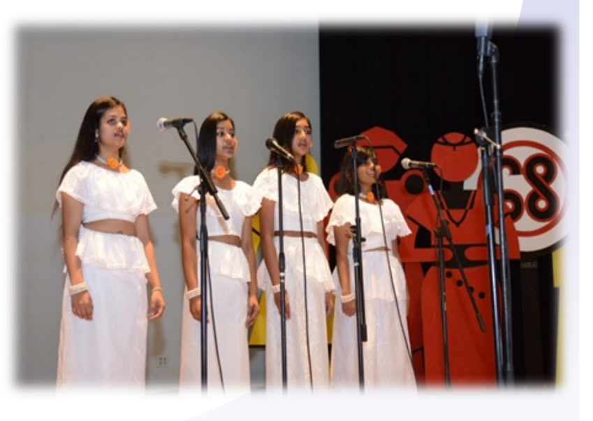
Performance at community event to mark Sri Lanka's 68th Anniversary of Independence

The Mission together with the evening community also held an event at event featured the Ukrainian Cultural Centre in archival photo- New Jersey, to mark the 68th angraphs on dis- niversary of Independence for play throughout the wider Sri Lankan community, mission on Sunday 7 February. Over 800 that guests were in attendance. Budtold the unique dhist, Hindu, Islamic and Chris-Sri tian religious ceremonies and a Lanka's active cultural show reflecting involvement in the work of the UN, Lanka's diversity and showcasing gathering.