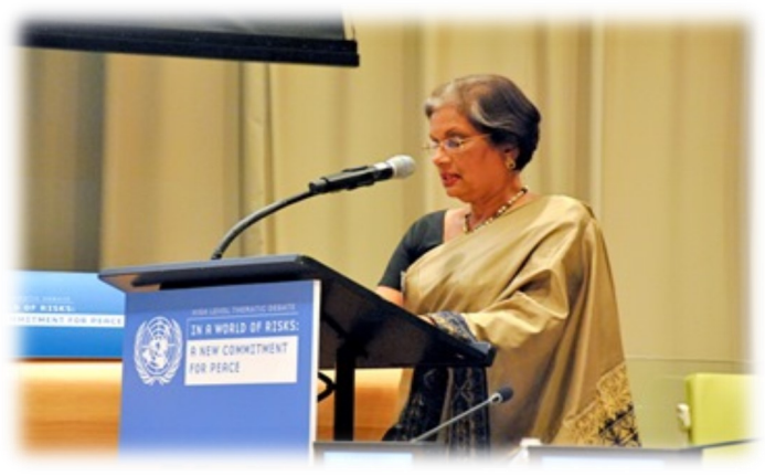
and manifestations. Former President Chandrika Bandaranaike Kumaratunga delivers address at mulate a comprehensive replenary debate of the UN General Assembly on UN, Peace and Security

Lanka as a beacon of hope to the world as the international commu-"Terrorism has become today, the nity faces one of its most complex