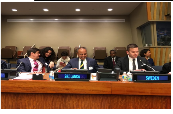
Hon. Sagala Ratnayake, Minister of Law and Order and Southern Development was a panelist at the Learn First side event