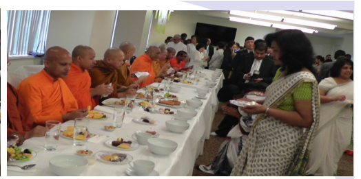
Prayer service and offering of heel dana during Vesak Celebrations held in the Permanent Mission of Sri Lanka on 20 May 2016