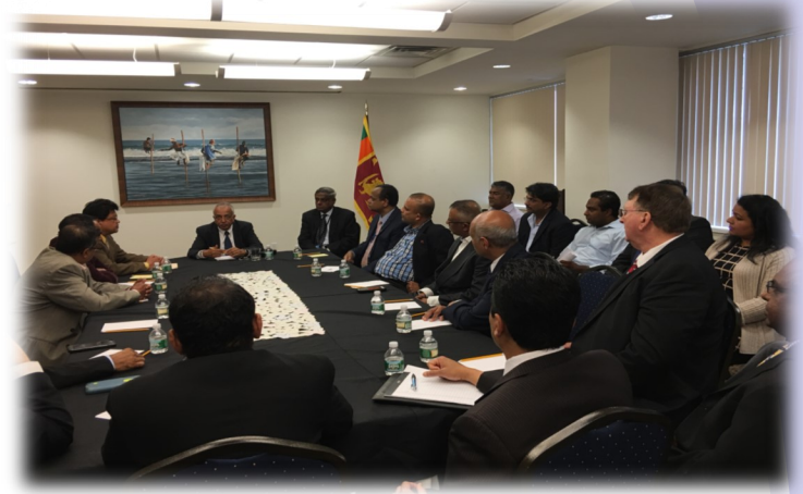
Hon. Malik Samarawickrama, Minister of Development Strategies and International Trade, meets with members of the Sri Lankan business community

The Minister said that the government is now taking advantage of this opportunity to reinforce our 68 year old democracy, push through constitutional reform, revive engagement in international affairs and implement the_