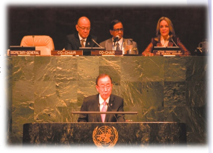
Secretary-General Ban Ki-Moon addresses the gathering during Vesak celebrations held in the UN General Assembly Hall

The United Nations Day of Vesak was celebrated in New York on 20 May 2016 in accordance with the UN General Assembly resolution 54/115 recognizing the day of Vesak internationally as the most significant day for Buddhists all over the world. The Permanent Mission of Sri Lanka to the United Nations in New York took the lead in organizing this year's UN Day of Vesak along with the Permanent Mission of Thailand and the Missions of the states that cosponsored the resolution in 2000.