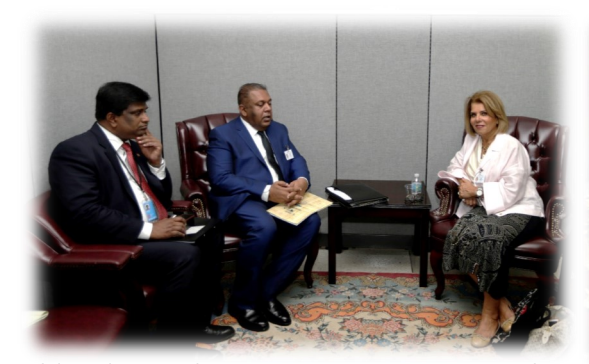
A bilateral meeting between Foreign Minister Hon. Mangala Samaraweera and Ambassador Moushira Khatab, Candidate for the post of Director-General of UNESCO from Egypt