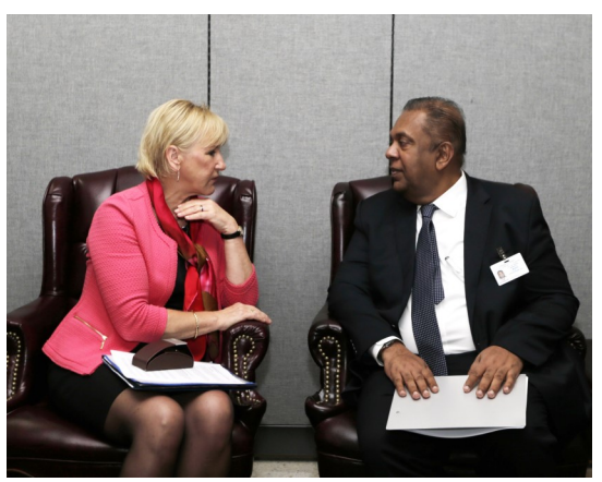
Hon. Mangala Samaraweera had a bilateral meeting with Ms. Margot Wallstrom, Minister of Foreign Affairs of Sweden