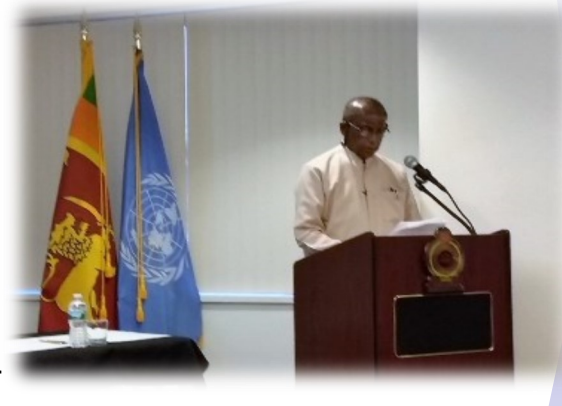
and Wildlife of Sri Lanka, delivers opening remarks

of the Asia- Pacific Forum on Sustainable Development (APFSD) pointed out that Sri Lanka is the first country in the Asia-Pacific region to establish a Ministry for Sustainable Development. As the current Chair of the APFSD, Sri Lanka is now in a unique leadership position to champion trans-