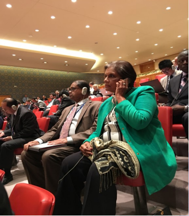
Former President Chandrika Kumaratunga attended a Security Council meeting