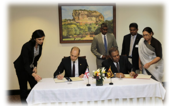
Minister of Foreign Affairs of Georgia Hon. Mikheil Janelidze and Foreign Minister of Sri Lanka Hon. Mangala Samaraweera signed agreements between the governments on Visa Exemptions for holders of Diplomatic and Official/Service Passports