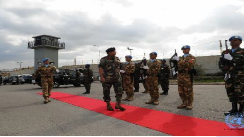
Guard of Honour