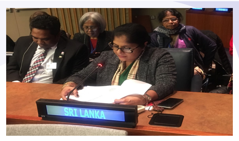
Hon. Chandrani Bandara delivers remarks at the Ministerial Segment Roundtable during the 60<sup>th</sup> Commission on the Status of Women