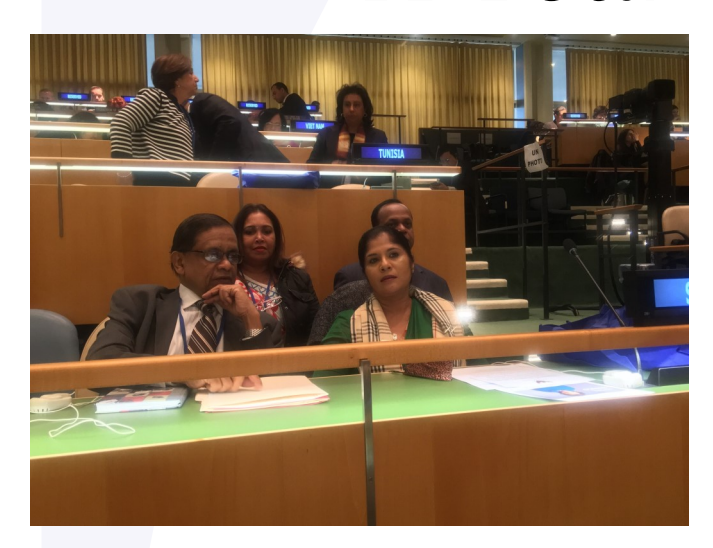
Minister Chandrani Bandara at the General Assembly Hall attending the 60<sup>th</sup> Commission on the Status of Women