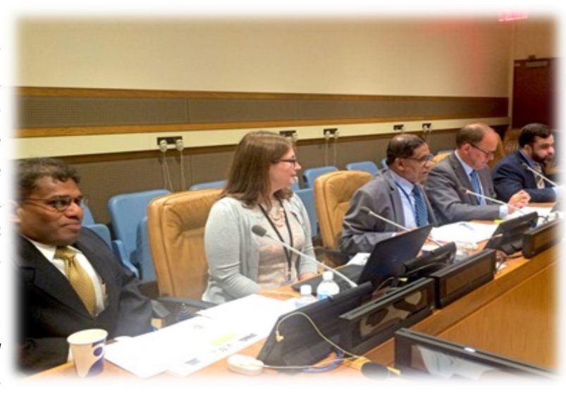
Panelists at the side event on regional collaboration on political rights for persons with disabilities

tive of Sri Lanka to the United Na- that provided multiple accessible poll-Sustainable Development