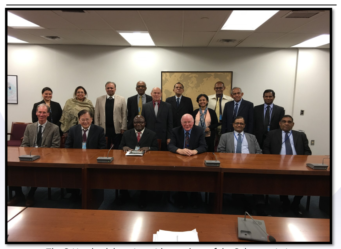
The Sri Lanka delegation with members of the Subcommission