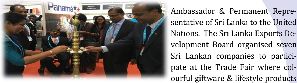
Lighting of the Traditional Oil Lamp at the Sri Lanka Pavilion

Sri Lanka participated at the popular 'Artisan Resource at NY NOW 2016' held from 21-24 August 2016 at the Jacob Javits Center in New York. The Pavilion showcased some of Sri Lanka's finest products in the niche market and the exhibits were de-