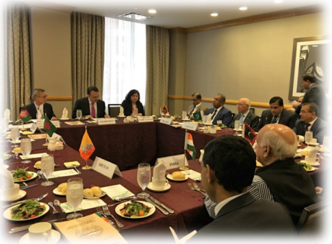
Foreign Minister Hon. Mangala Samaraweera attended the Informal Luncheon Meeting of the SAARC Council of Ministers