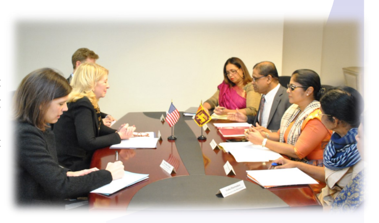
Hon. Chandrani Bandara meets US Ambassador at large for Global Women's Issues, Ms. Catherine Russell

which would be a useful way to institutionalize the deep cooperation between GoSL and US on issues related to women and girls. Gender issues such as equitable participation in all aspects of politics including in leadership positions, violence against women and girls, women's economic empowerment were discussed. Minister Bandara reiterated Sri Lanka's strong position on women's economic empowerment as a prerequisite for sustainable development and pro-poor growth. She said that as a Cabinet Minister she was fully aware that achieving women's economic empowerment requires sound public policies, a holistic approach and that a strong commitment and gender-specific perspectives must be integrated into every policy and program.