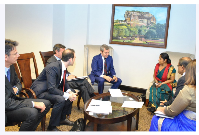
Italy's Vice Foreign Minister Benedetto Della Vedova met with Minister of Women & Child Affairs Hon. Chandrani Bandara on the sidelines of the 60 <sup>th</sup>Commission on the Status of Women