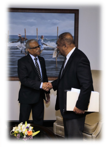
A bilateral meeting was held between Foreign Minister Hon. Mangala Samaraweera and Foreign Minister of the Maldives Hon. Dr. Mohammed Asim