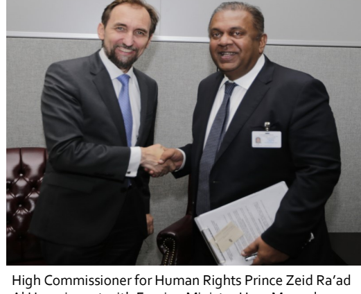
Al Hussein met with Foreign Minister Hon. Mangala Samaraweera