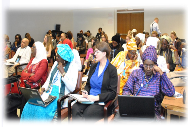
Audience at the event entitled 'Achieving Gender up a 'functioning and Equality through WASH'

However, the remaining 8% of sanitation and hygiene coverage and 6% in drinking water coverage highlights that Sri Lanka is yet to achieve 'universality' in these two core areas. The key groups and communities concerned with which the Government of Sri Lanka is currently working on, are the fishing communities, tea plantation workers in the hill country and villages in some remote areas. Sri Lanka has set an ambitious target in achieving 100% success in these areas by 2020, the ambassador also said.