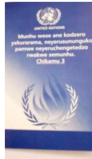
UDHR Shona translation

UNIC Harare has printed Shona and Ndebele versions of the Universal