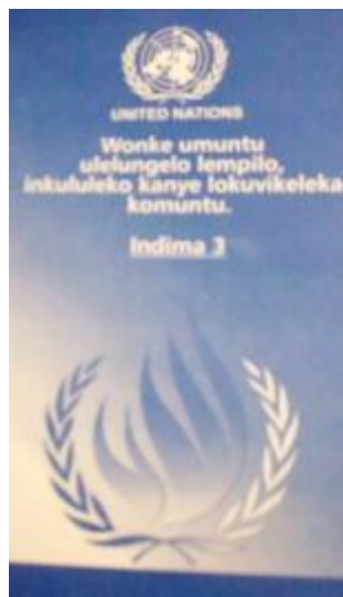
UDHR Ndebele version