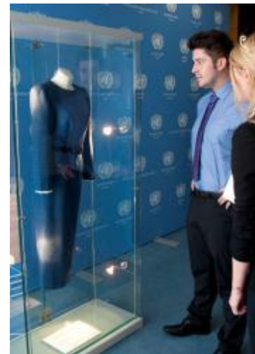
Exhibit on Conchita Wurst's visit to the Vienna International Centre