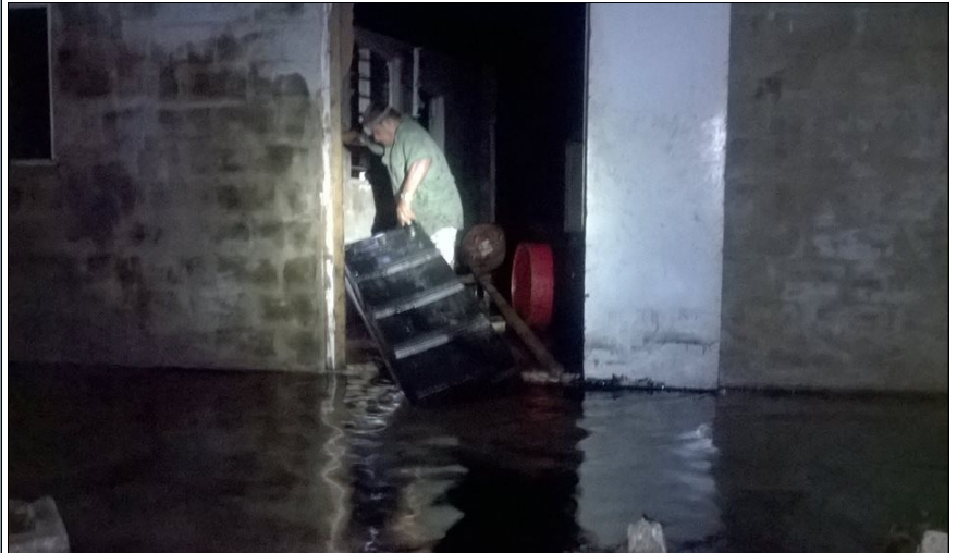
Nukulaelae Power house flooded and power supply had been switched off

NUKULAELAE Island in the south of Tuvalu had battered by storm surges and strong wind in the last 48 hours.