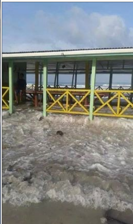
Alofi at Vaitupu Island flooded on Thursday this week

GOVERNOR General His Excellency Sir Iakoba Taeia Italeli, this morning declares a State of Emergency for the whole of Tuvalu.