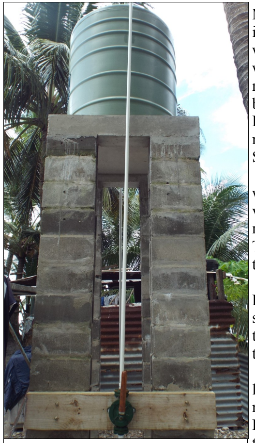
Overhead tanks with manual hand pump

MOST vulnerable families to impacts of climate change and water security on Funafuti have water flowing easily for their needs, thanks to the community based project funded by the European Union and implemented by the University of the South Pacific USP.